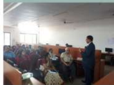
MODERN TRENDS IN POWER SYSTEM DESIGN