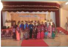
SAMAVARTHANAM 2018 M. TECH