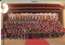
SAMAVARTHANAM 2018 B. TECH